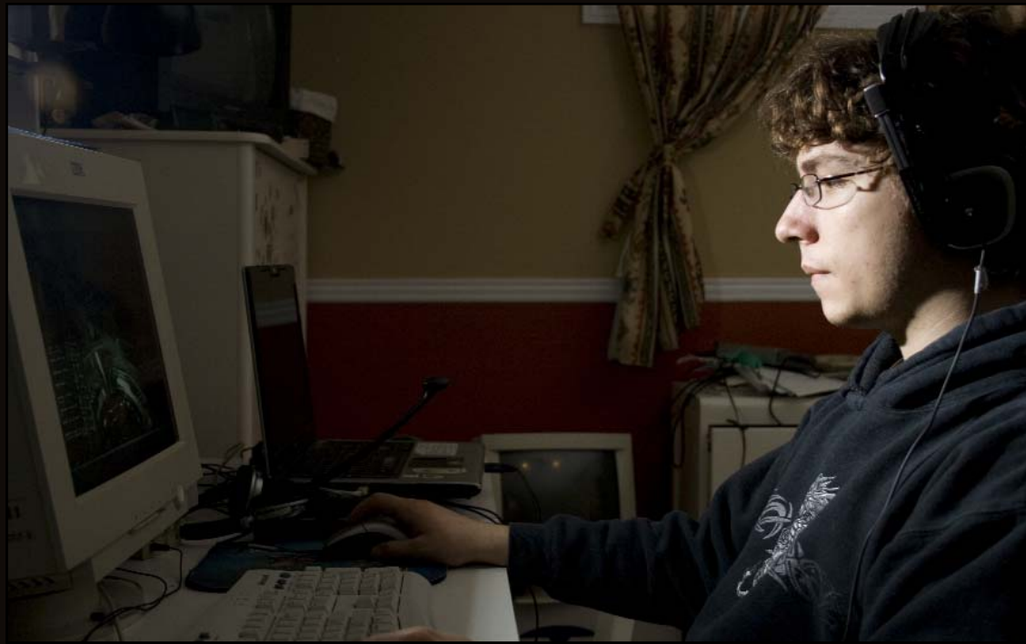
THE BOX: This is the box gamers look at. The other box is hidden, but it's the real gamers pride.