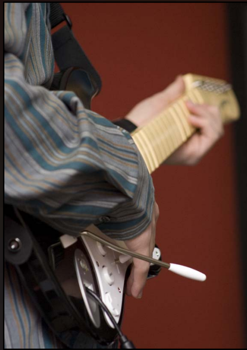
MUSIC: It doesn't mean you can actually play guitar