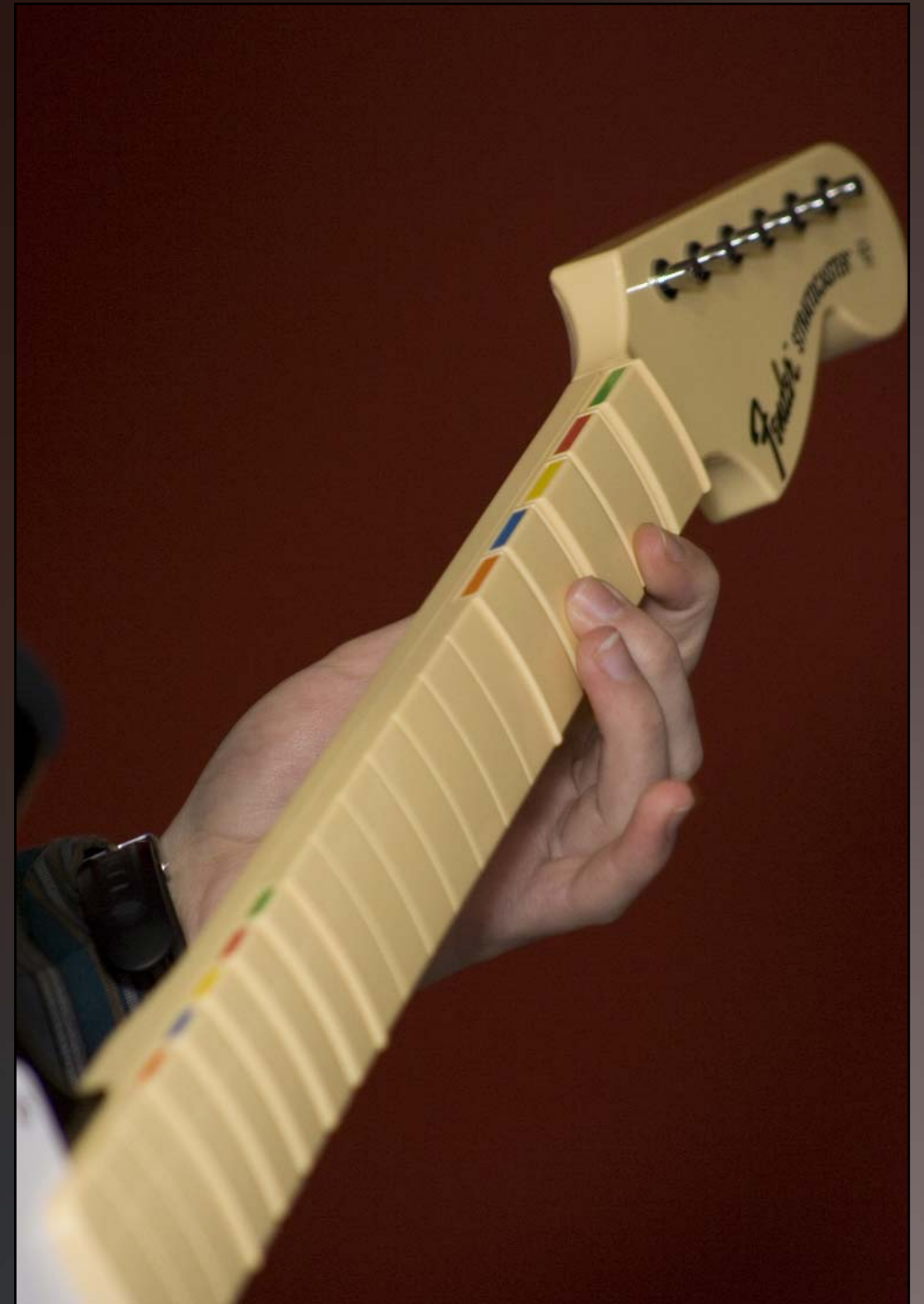
THE LEGEND: Once a noob, he soon rose to become a legnedary rockband bassist.