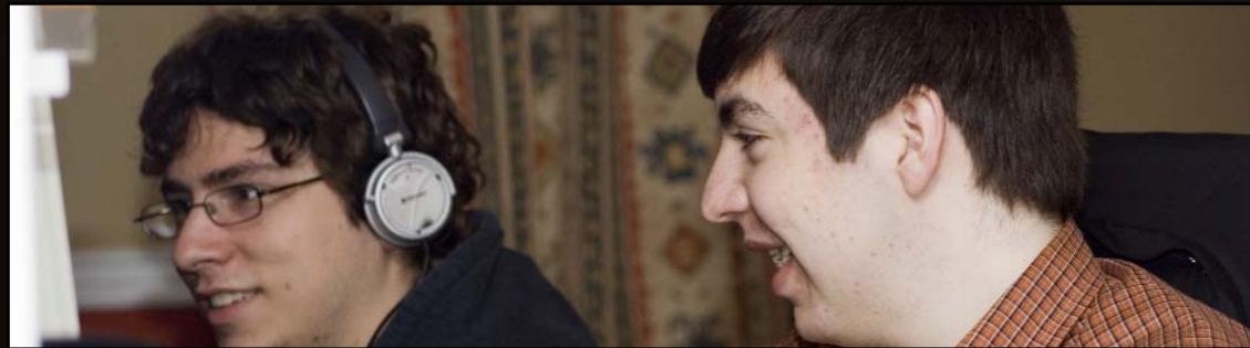
IT'S FUN: To kick some arsenal in groups.