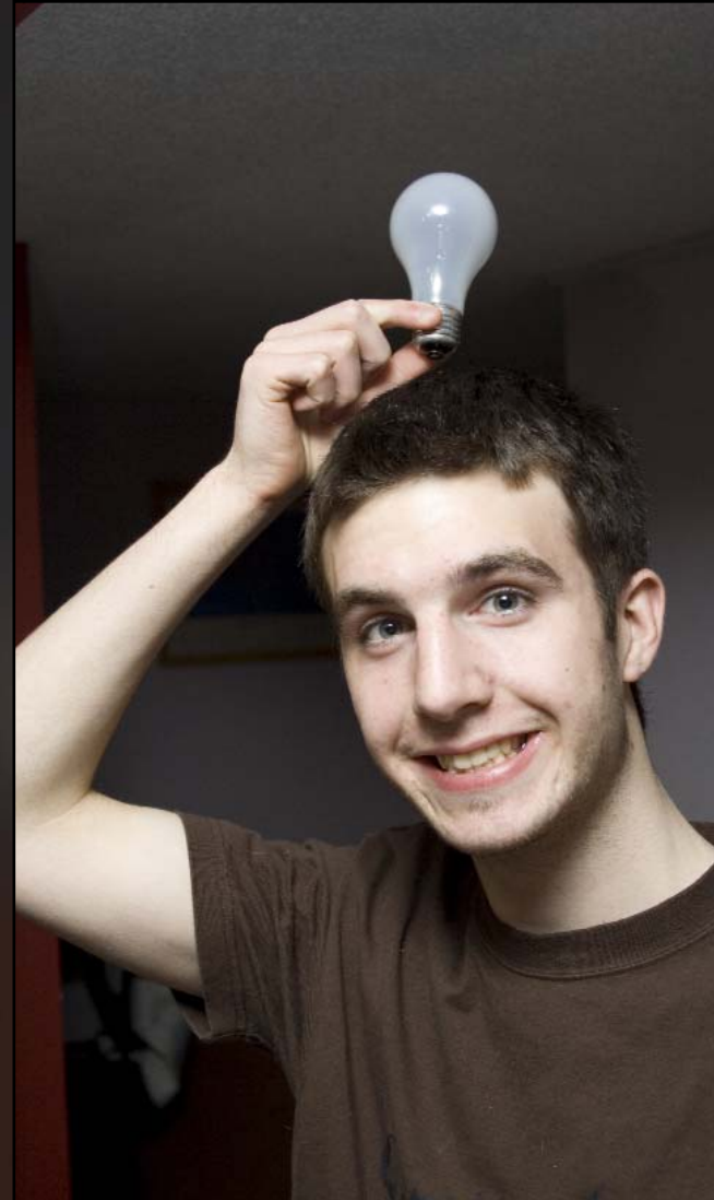
LIGHT UP: Well, he tried, but failed...