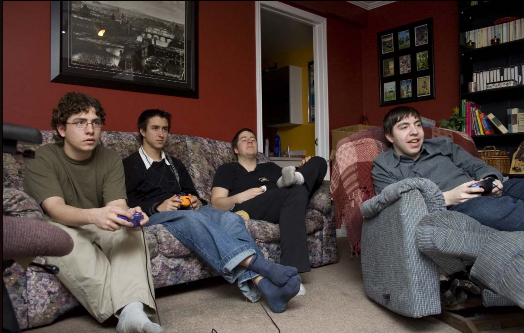
GAMERS UNIT: This is what happens when you set up a game night with friends because you have a photo essay due.